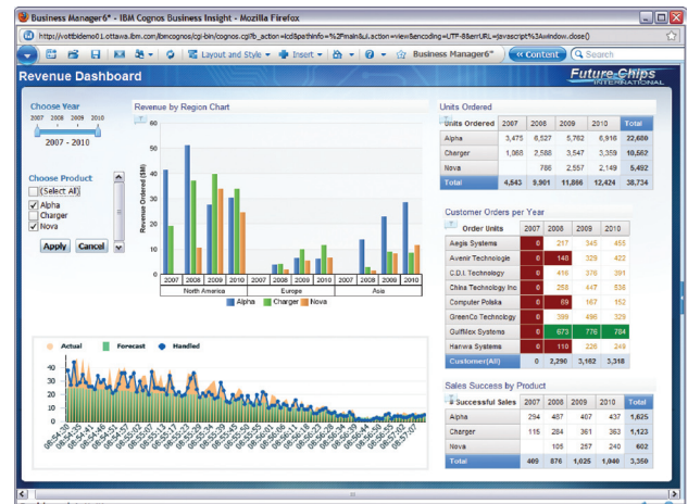
Analysis and summary reporting from many data sources

With Cognos Business Intelligence Query and Reporting, business users can author and modify their own reports with minimal training or IT involvement. Users can arrange report objects by dragging and dropping them into the report authoring window. Report layout automatically adapts and rearranges as report objects are added or removed. The flexibility of the task-based interface reduces the time required to author and modify a report, so business users can find insights on their own with an easy-to-use interface and trusted corporate information.